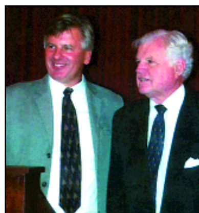
Ed and Ted Kennedy