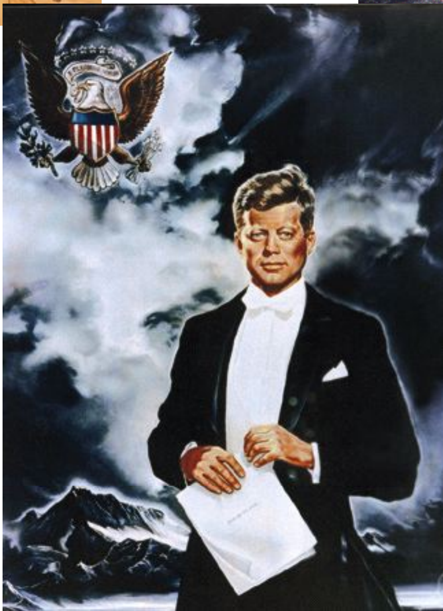
President John F. Kennedy 48" X 60" Oil on Canvas Library of Presidential Papers Collection