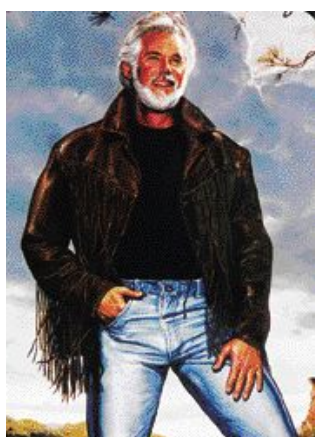
Kenny Rogers 36" x 48"

"The Wonderful People Who Collect My Works Give Me The Wings To Fly As An Artist."