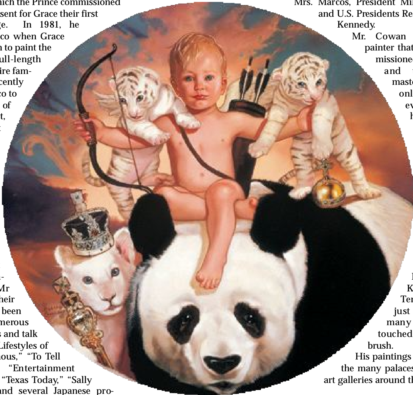
"Panda Dreams of Cupid's Interference" 3' Circular Oil on Canvas

His paintings are celebrated in the many palaces, museums, and art galleries around the world.