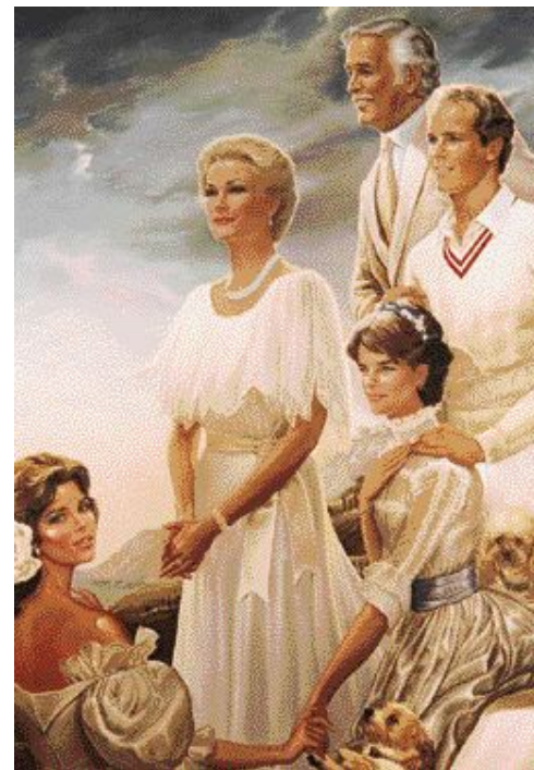
"La Famille Princiere" Palace Collection, Monaco 54" X 90" Oil on Canvas