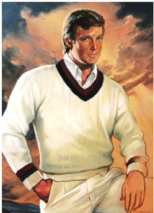
Donald Trump 30" X 40" Mar-A-Lago Collection Palm Beach, Florida