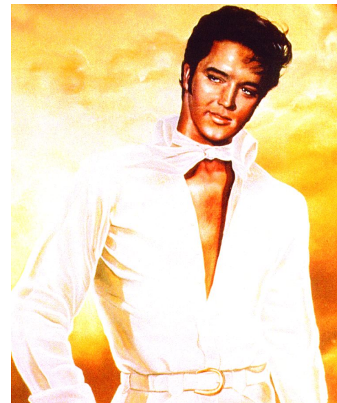
Elvis Aaron Presley 48" X 72"-Oil on Canvas Graceland Collection Memphis, Tennessee