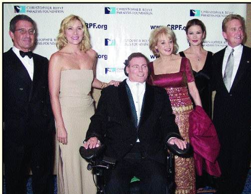
The Christopher Reeve Paralysis Foundation Fundraiser We deeply regret the passing of Christopher Reeves. For the past 9 years Mr. Reeves devoted all of his energies as an advocate for spinal-cord research. We hope that one day a cure will be found.. 973-379-2690 • www.crpff.org