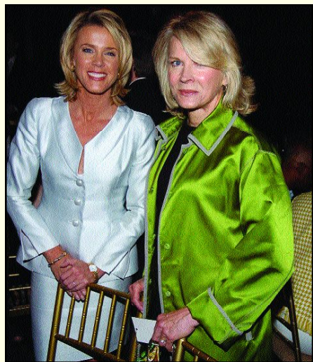
Deborah Norville and Candice Bergen at the Elton John concert and gala to benefit the Juilliard School The Rainbow Room