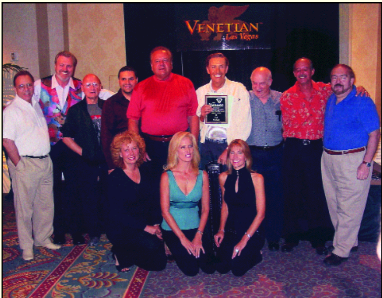
The 8th Annual Sorvino Asthmas Foundation Pro-Celebrity Pool Tournament, Las Vegas.