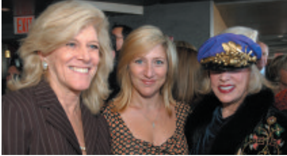
Lvnn Sherr, Edie Falco and Gael Greene at The Annual Citymeals-on-Wheels Womens Power Lunch. www.citymeals.org