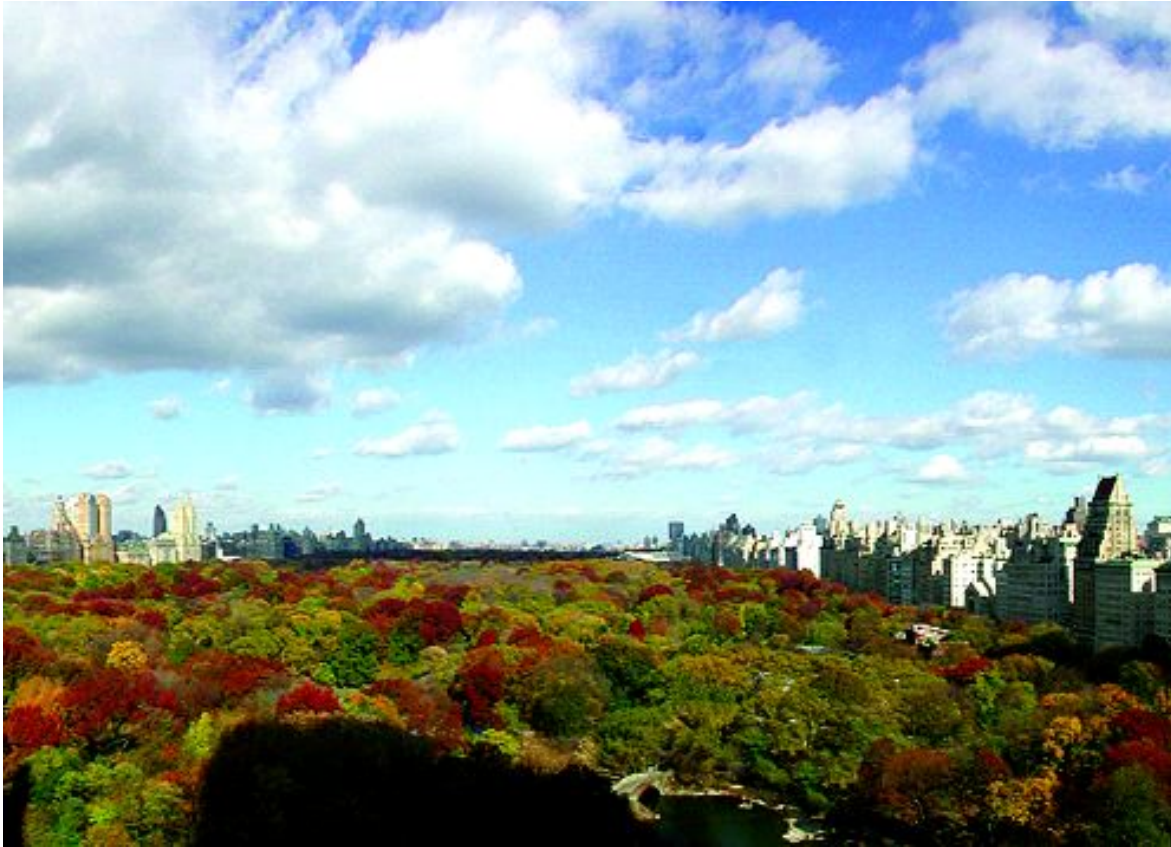
One of the many splendiferous views of NY's Central Park as seen from The Park Lane

The Helmsley Park Lane hotel is the Primere Grand Luxe hotel overlooking Central Park in New York's grandest location, right off Fifth Avenue and Madison Avenue shopping, steps to FAO Schwartz, Barney's, Bergdorf-Goodman, Harry Winston, Tiffany's Carnegie Hall, Lincoln Center, and Broadway theater.