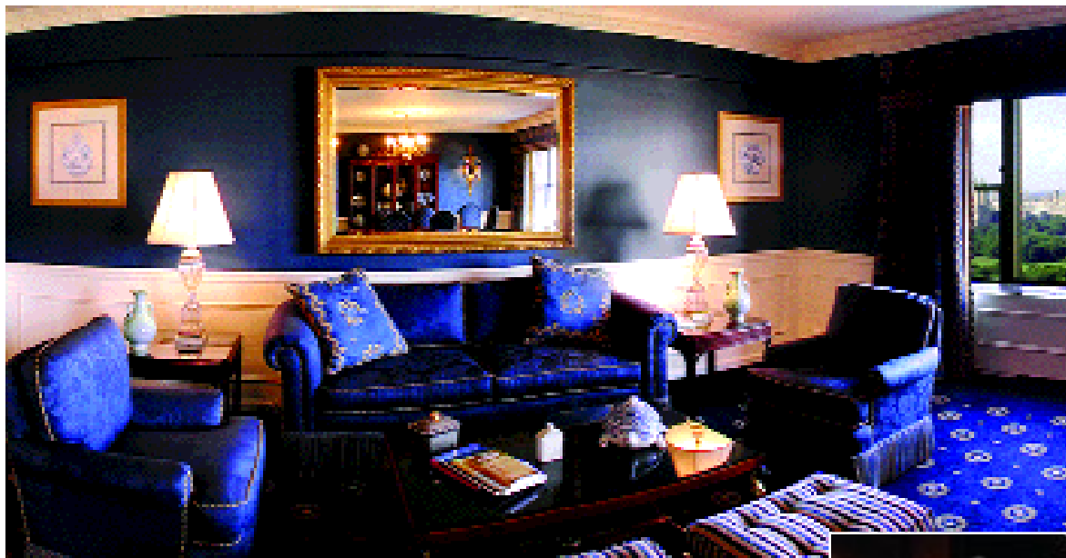
The Presidential Suite