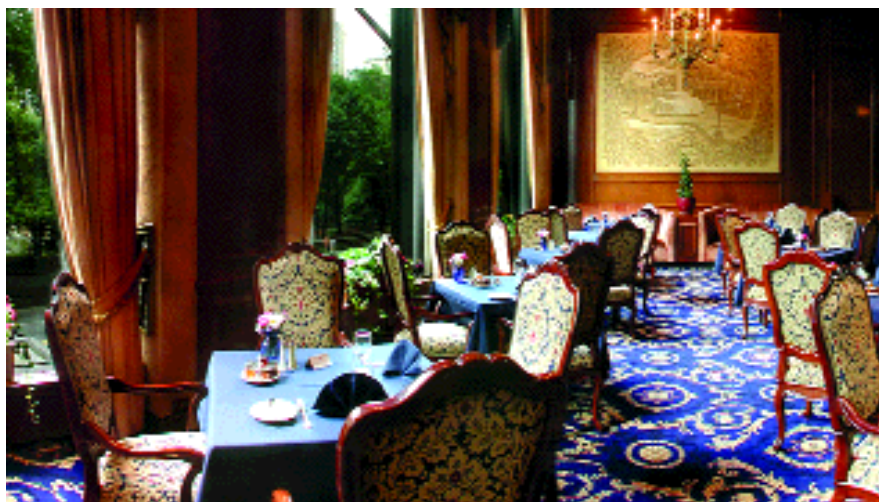
A Room With A View