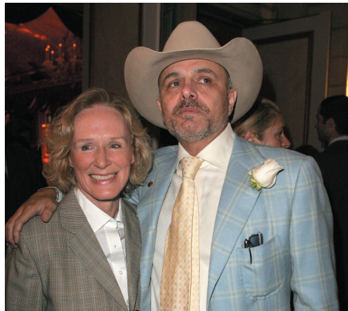
Glenn Close, a supporter and volunteer with The Sopranos' Joe Pantoliano