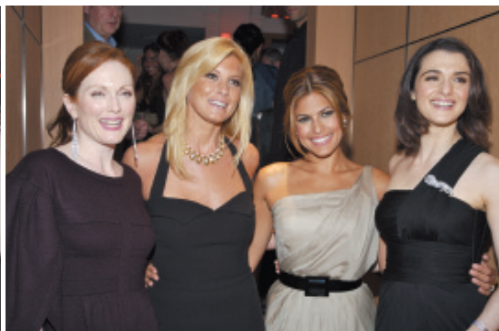
2007 Celebrity Ambassadors: Julianne Moore, Faith Hill, Eva Mendes and Rachel Weisz