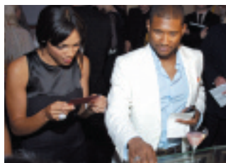
2007 Celebrity Ambassadors Rosario Dawson and Usher