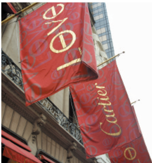
Cartier Love Flags