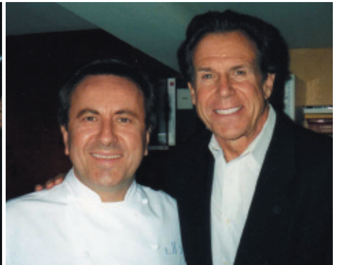
Chef Daniel Boulud in the 'Skybox' at Restaurant Daniel