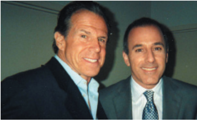
Matt Lauer backstage at TODAY