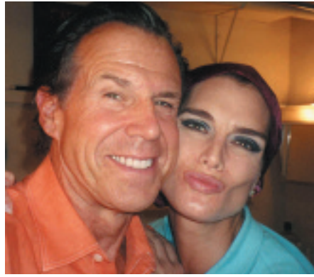
Backstage with Brooke Shields