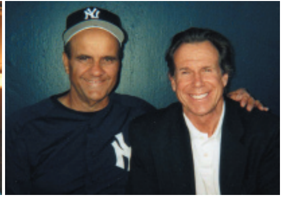
Joe Torre in Yankee dugout