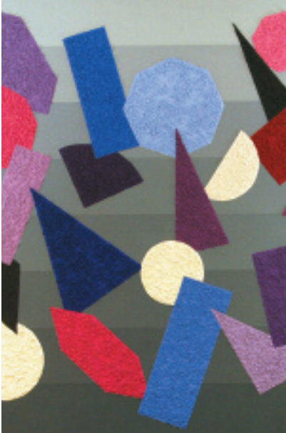
David Rappaport Confetti © 1991