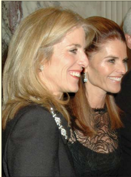
Caroline Kennedy Schlossberg and Maria Shriver at the Rita Hayworth Alzheimer's Ball at the Waldorf Astoria in Manhattan, N.Y. on October 5, 2004