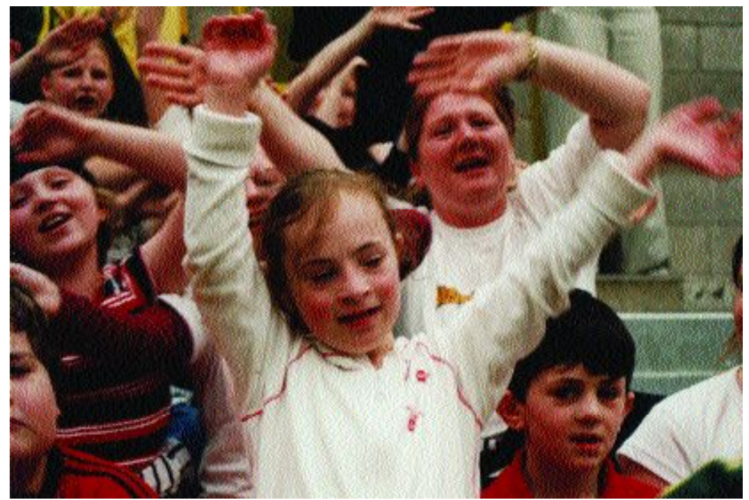
Children of Ireland cheering there team