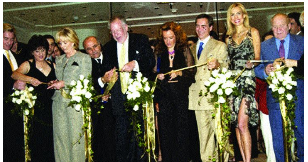
New store opening in Las Vegas