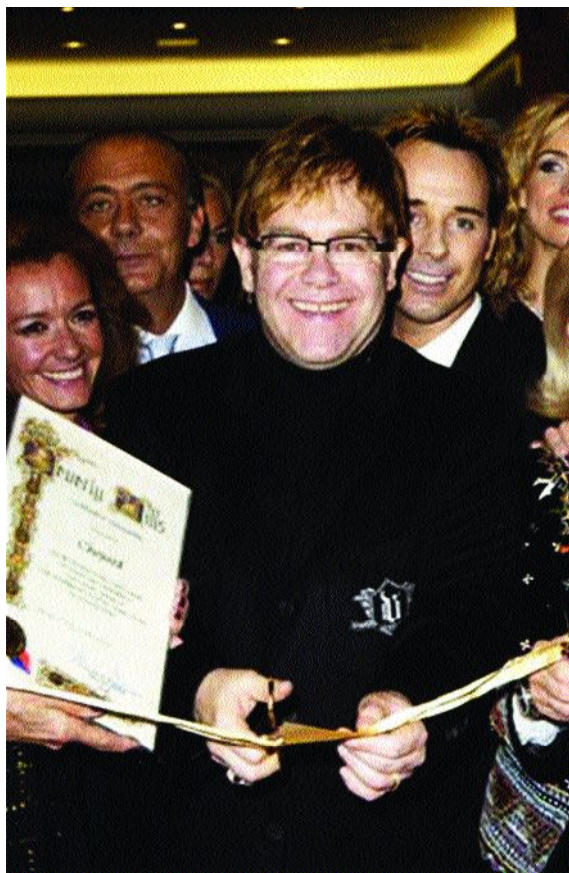
Elton John cuts a perfect ribbon