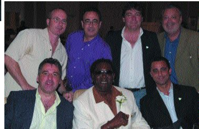
Clarence Clemons and friends

For more than three decades, Florence Fuller Child Development Centers have provided quality childcare and family support services for economically disadvantaged families. The center's mission is to empower these families to succeed and to prepare the children for a lifetime of positive learning. For more information please visit: www.ffcdc.org