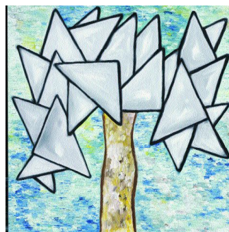
"Winter Tree on Oak Paneled Box #1"