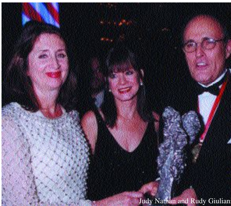
Judy Nathan and Rudy Giuliani

On November 15, 2006, the Art4Love Gallery will host the solo exhibition of Lin Evola, Tragedy to Transformation. Art4Love is located in Manhattan at 45 East 20th Street, 9th floor. The exhibition displays a provocative collecting of drawings depicting human metamorphoses.