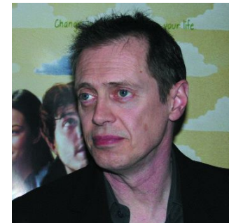
Steve Buscemi at the Film Society of Lincoln Center's Young Friends of Film screening of "Lonesome Jim."

In addition to the New York Film Festival, the Film Society co-sponsors (with the Film and Video Department of The Museum of Modern Art) the New Directors/New Films series. For 25 years, this series has brought public attention to the works of up-and-coming film artists. New Directors/New Films is famous for discovering new talents, including Steven Spielberg, John Sayles, Lasse Hallström, Spike Lee, Atom Egoyan, Nick Gomez, Gregg Araki, Todd Solandz, Mary Harron and Richard Linklater.