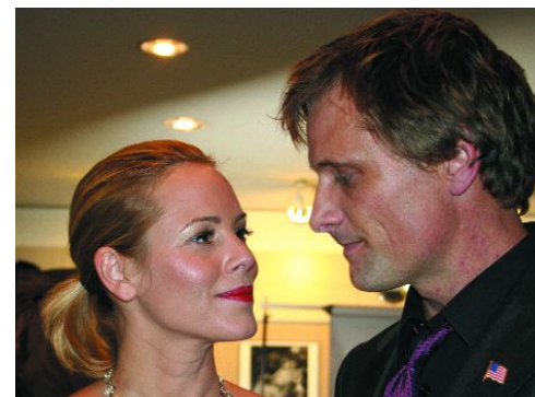
Maria Bello and Viggo Mortensen at the Film Society of Lincoln Center's special screening of "A History of Violence."