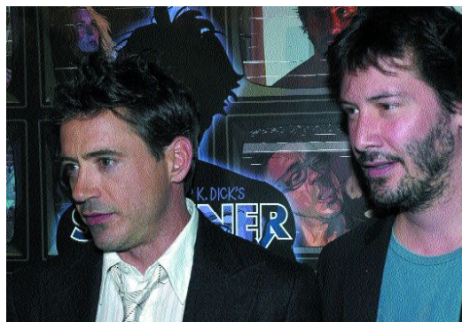
Robert Downey Jr. and Keanu Reeves at the Film Society of Lincoln Center's advance screening of "A Scanner Darkly"