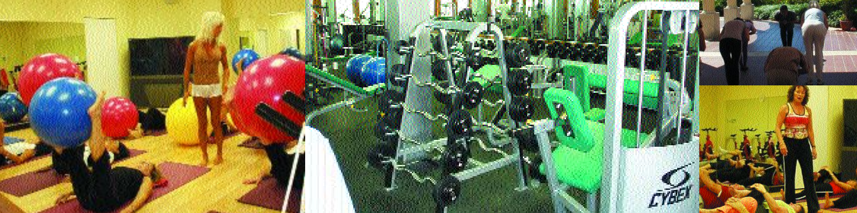
Black Tie International 63