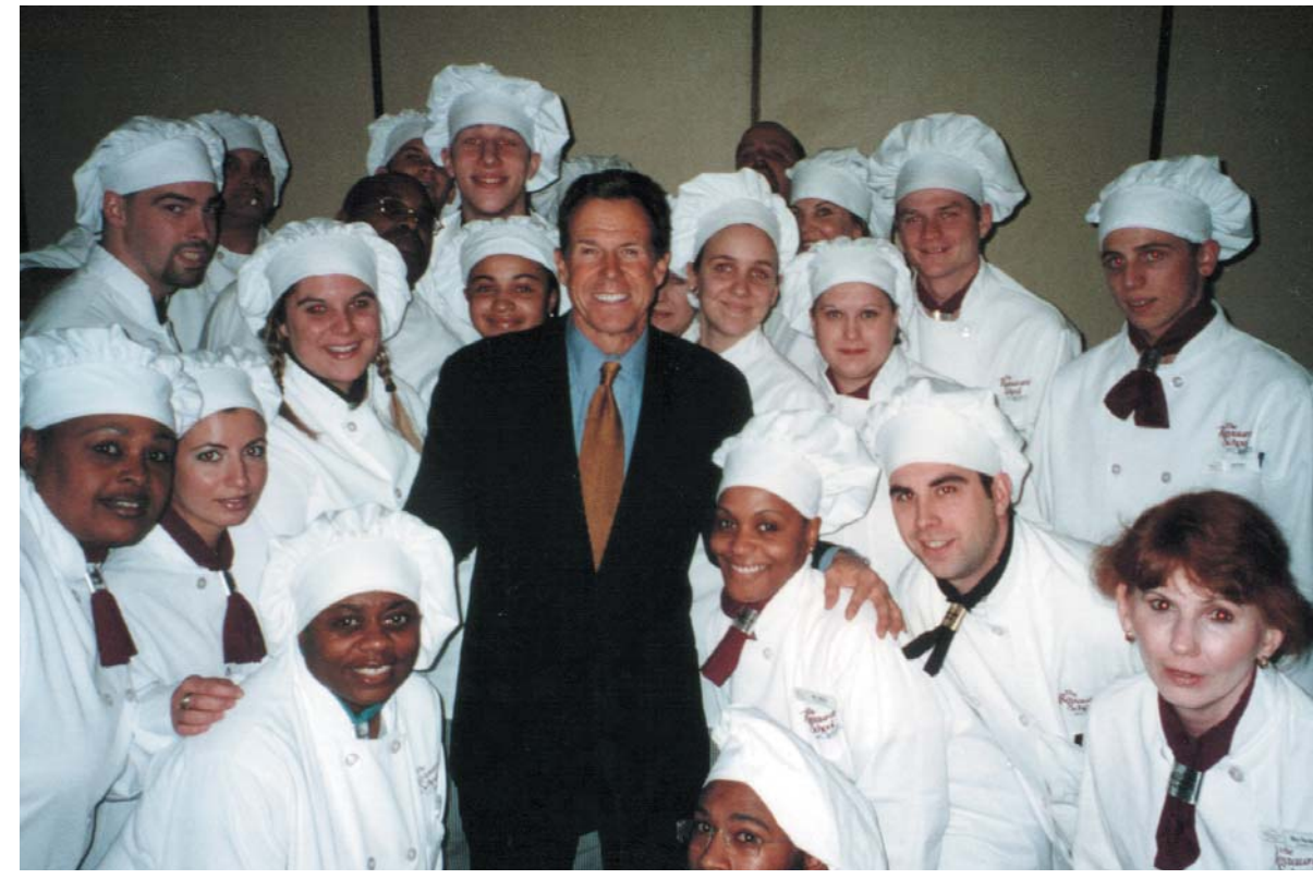
Chefs Galorie in Philadelphia