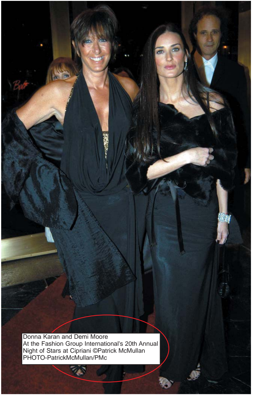
Donna Karan and Demi Moore At the Fashion Group International's 20th Annual Night of Stars at Cipriani