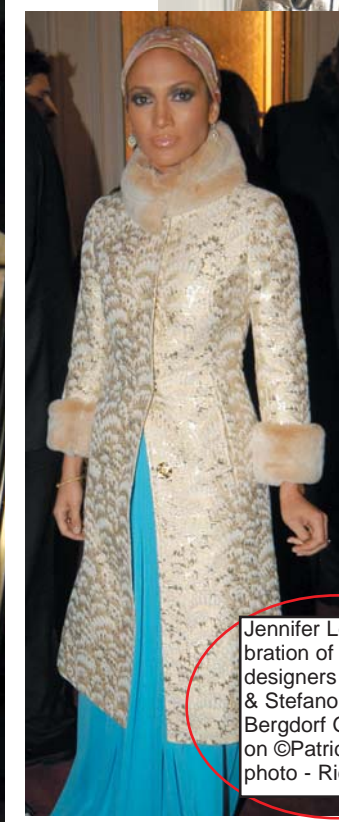
Jennifer Lopez at the celebration of 'Hollywood' with designers Domenico Dolce & Stefano Gabbana at Bergdorf Goodman, NYC on