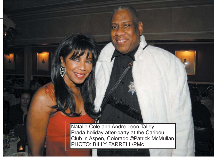
Natalie Cole and Andre Leon Talley Prada holiday after-party at the Caribou Club in Aspen, Colorado.