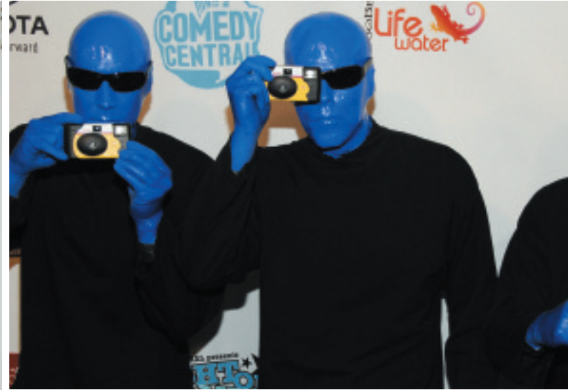
Blue Man Group