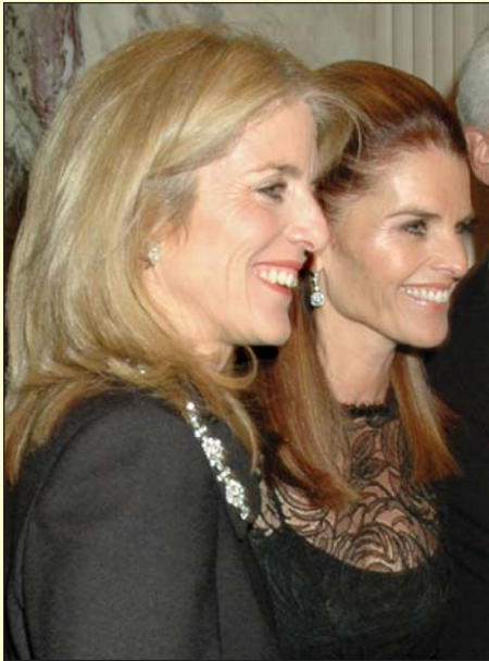
Caroline Kennedy Schlossberg and Maria Shriver at the Rita Hayworth Alzheimer's Ball at the Waldorf Astoria in Manhattan, N.Y. on October 5, 2004