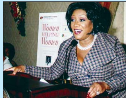
Patti LaBelle