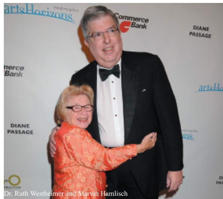
Dr. Ruth Westheimer and Marvin Hamlisch