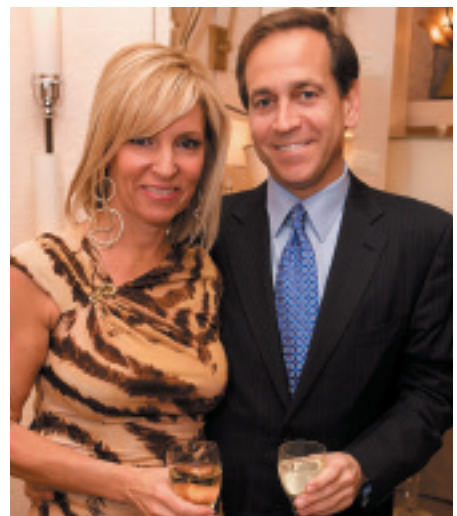
ture line at a party for Furnish A Future at Lampworks.