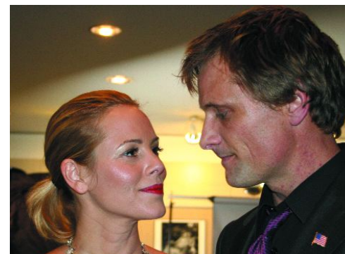
Maria Bello and Viggo Mortensen at the Film Society of Lincoln Center's special screening of "A History of Violence."