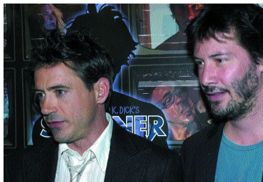
Robert Downey Jr. and Keanu Reeves at the Film Society of Lincoln Center's advance screening of "A Scanner Darkly"