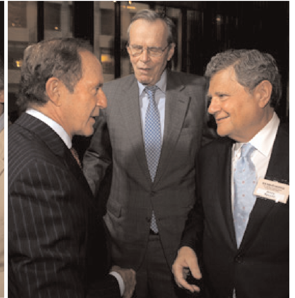
Mort Zuckerman, Donald Marron and Jerry Speyer