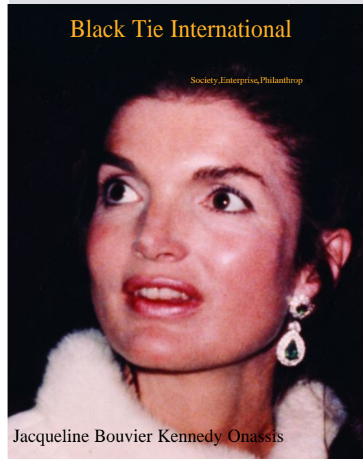
Jacqueline Bouvier Kennedy Onassis